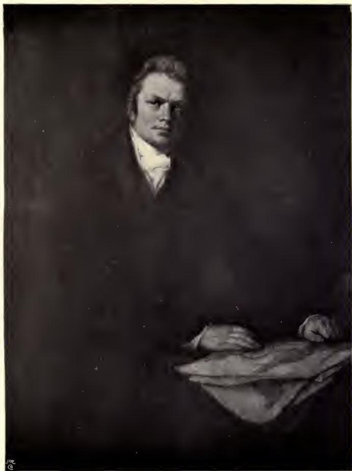
SIR ISAMBARD BRUNEL.